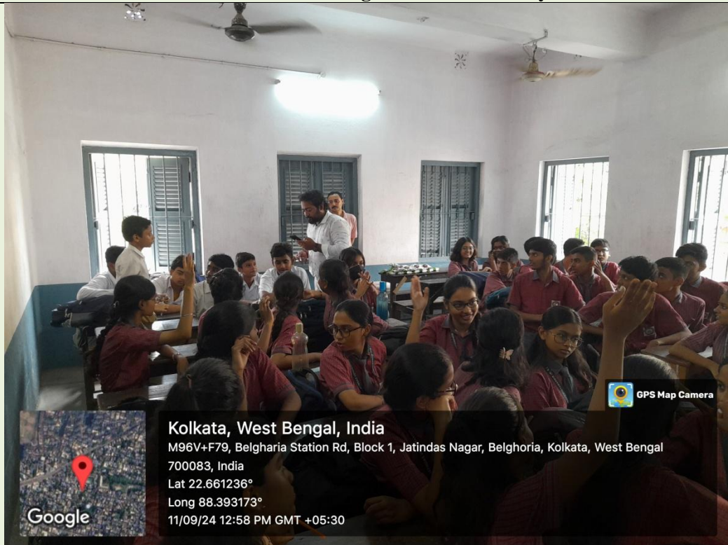
Quiz competition on world ozone day