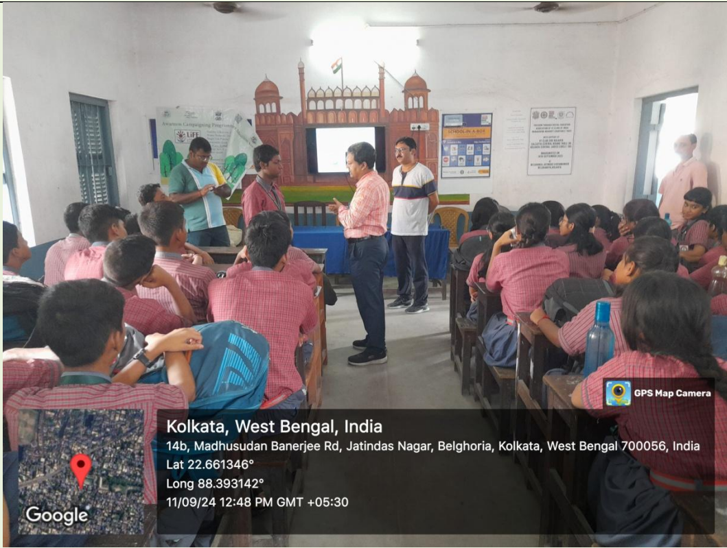
Students and EIACP Coordinator discussing on theme of the day in the technical session